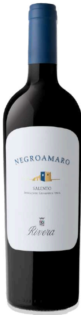
NEGROAMARO SALENTO I.G.T.