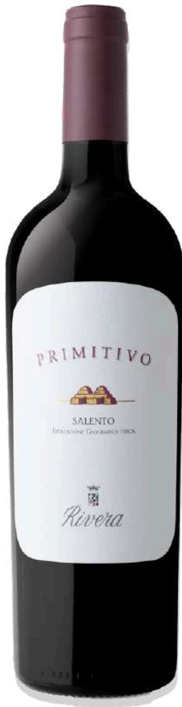
PRIMITIVO SALENTO I.G.T.