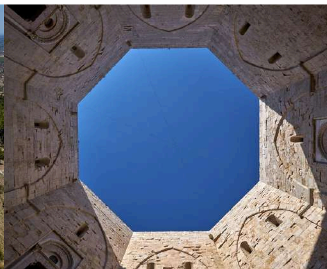
CASTEL DEL MONTE