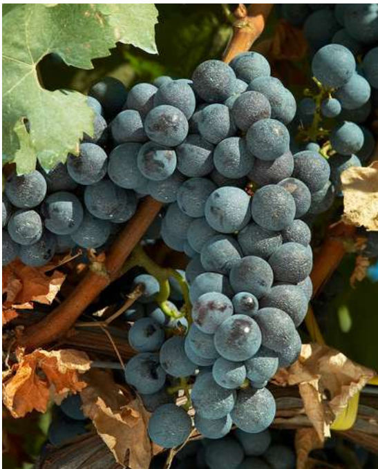
NERO DI TROIA

Common character of all Rivera wines is the winemaking style that rigorously interprets the different terroirs and grape varieties, highlighting balance, elegance and drinkability for the pleasure of discerning consumers. A style that brings together a bond with tradition and attention to the evolutions of technique and the market.