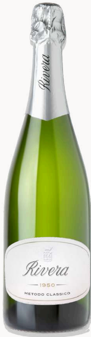
RIVERA 1950 PAS DOSÉ METODO CLASSICO BOMBINO BIANCO PAS DOSÉ