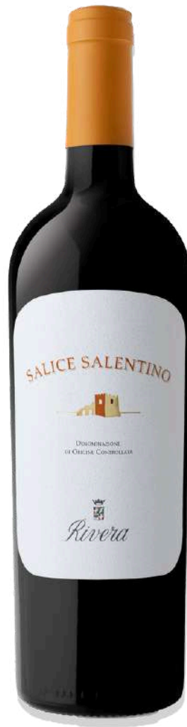
SALICE SALENTINO D.O.C.

Varieties 90% Negroamaro 10% Malvasia Nera