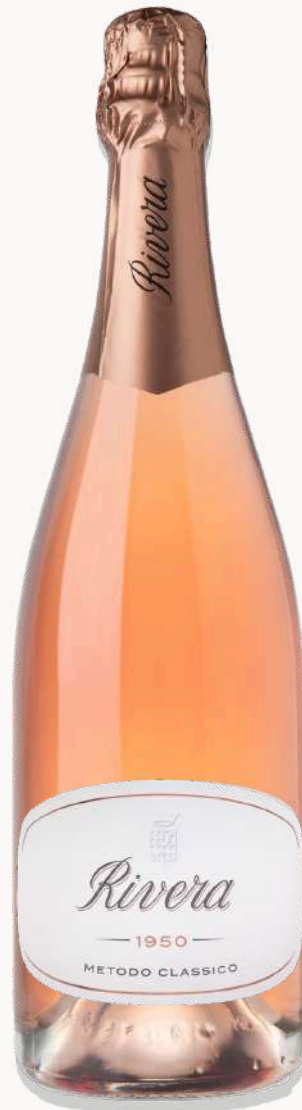
RIVERA 1950 ROSÉ PAS DOSÉ METODO CLASSICO BOMBINO NERO PAS DOSÉ